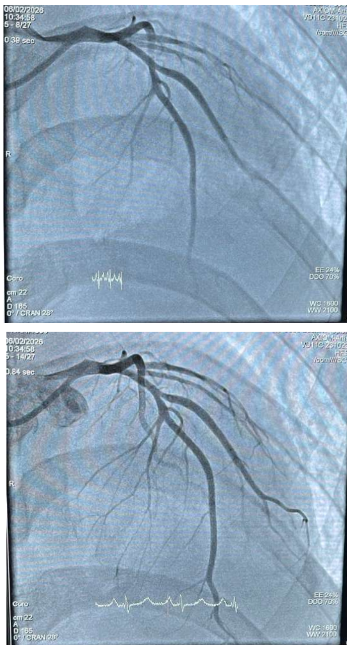
Figure 3. The coronary angiography (CAG) showed 80-90% stenosis in the ostial to proximal in LAD, a high thrombus burden with TIMI 2-3 flow, and no bleeding was occurred.