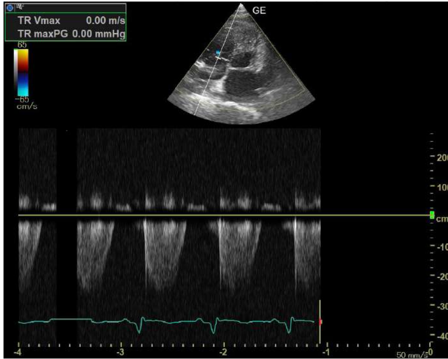
Figure 2. Echocardiography examination showed RWMA (+), moderate loculated pericardial effusion, reduced LV systolic function, and grade III diastolic dysfunction.