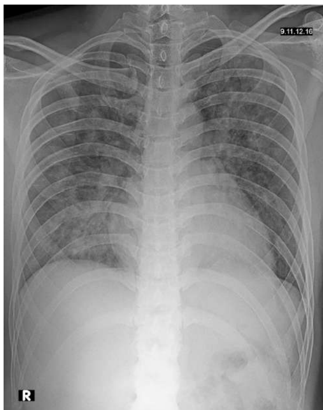
Figure 2. Thorax x-ray examination

The patient underwent the thorax X-ray examination and showed pneumonia, which can be seen below.